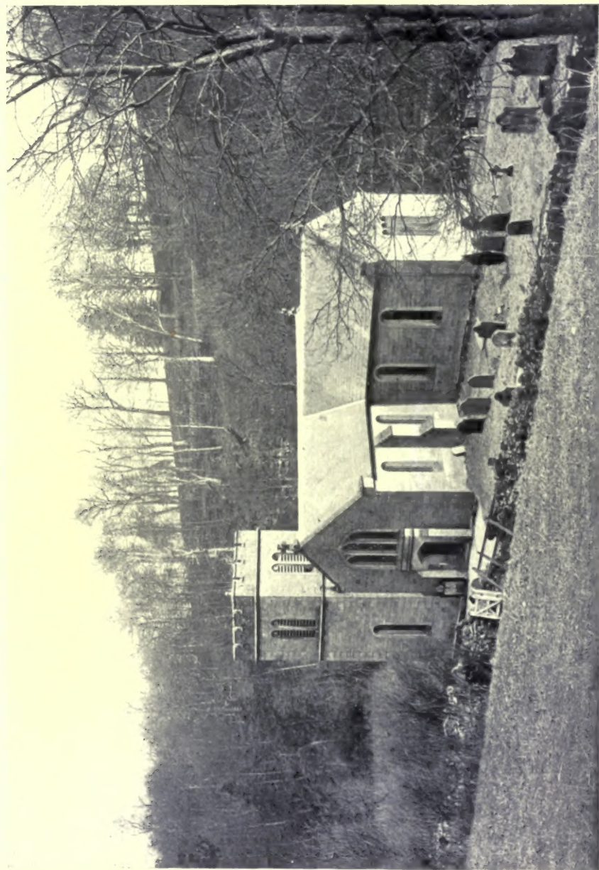
ASKHAM CHURCH, SHOWING SANDFORD CHAPEL.